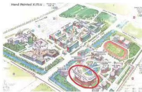
IBSS Building (South Campus of XJTU), 8 Chongwen Road, Dushu Lake Science and Innovation District, Suzhou Industrial Park, Suzhou, Jiangsu, China 215123